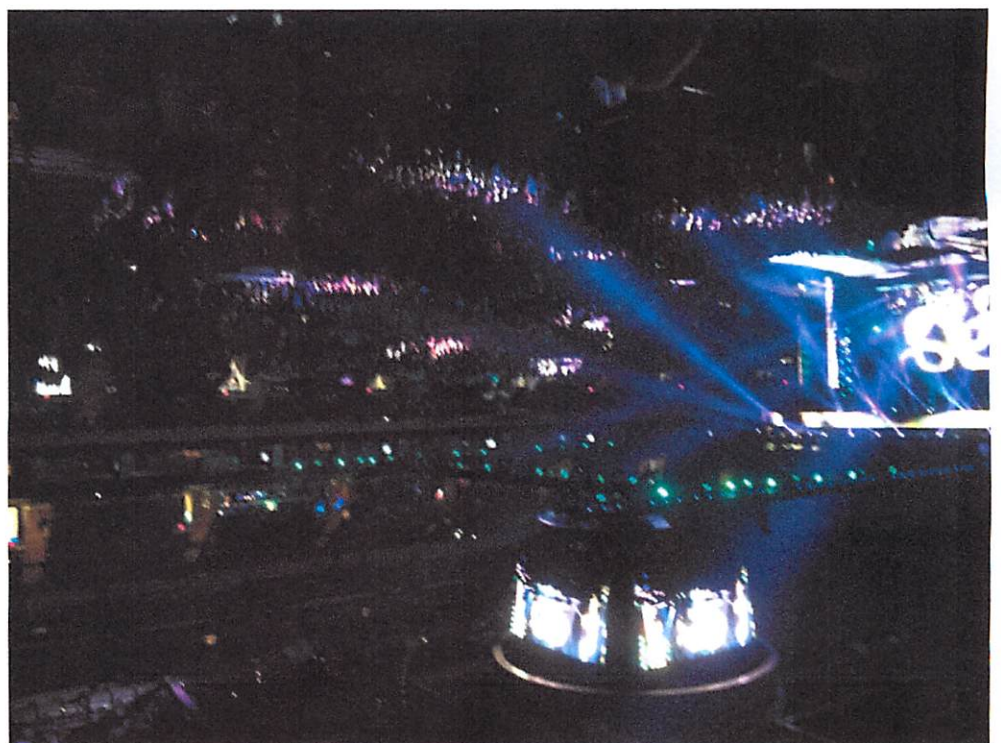
Power Positif at We Day