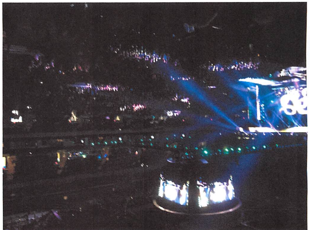
Power Positif at We Day